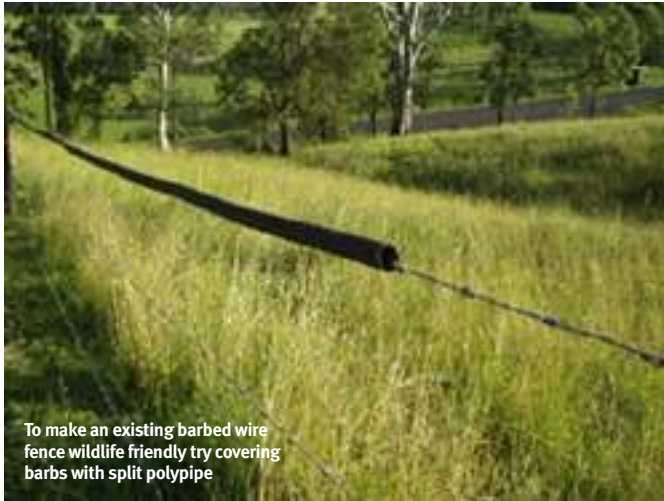
To make an existing barbed wire fence wildlife friendly try covering barbs with split polypipe